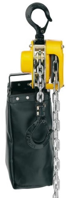
Optional: Chain container

Yale hoists and trolleys are not designed for passenger elevation applications and must not be used for this purpose.